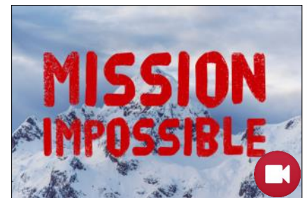
Session 5 Travis Moffitt