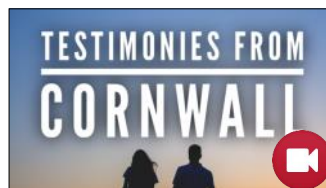
Cornish Testimonies Alan & Lorraine Carlin

It's not over... ...until God says it's over!