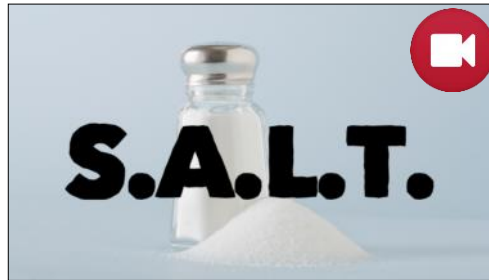
Session 3 Simon King

It's not over... ...until God says it's over!