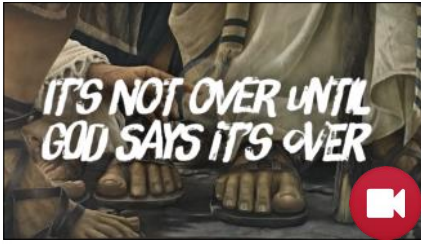
Session 1 Kingsley Armstrong