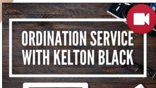
Session 6 Ordination Service with Kelton Black