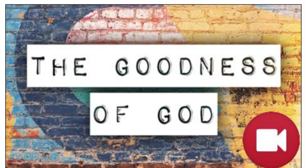
Session 7 Doug Pitman